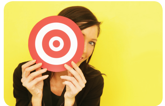
Campaign Director is an integral part of Concurrent's MDAS portfolio that enables highly targeted advertising

The Campaign Decision Engine is a high performance, SCTE-130 compliant Ad Decision Service (ADS) capable of providing real-time targeted ad placements for various types of placement opportunities. Using its patented targeted advertising technology, the Campaign